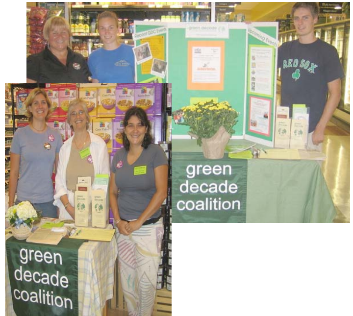
Green Decade table volunteers give out information on Whole Foods 5% Day.

support energy efficiency projects in low-income housing, wherever in the state the need is greatest.